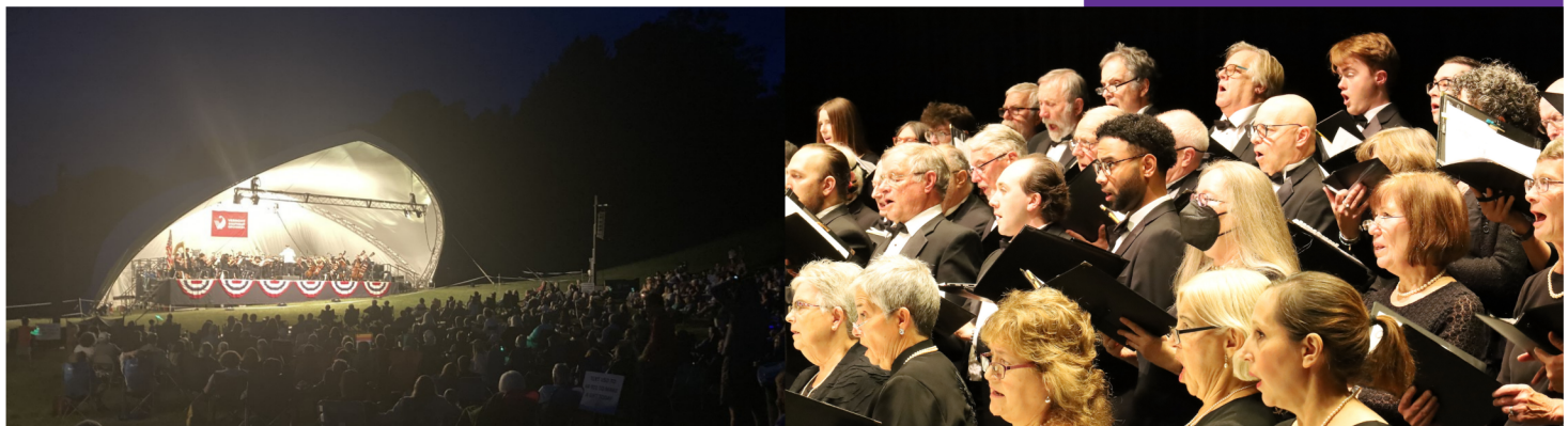
Members of the VSO Chorus at the Flynn October 2022