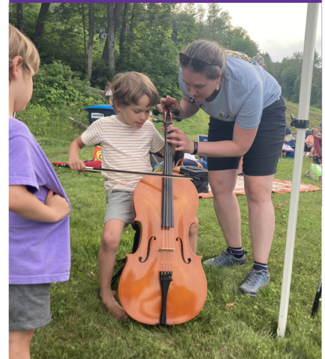
An aspiring cellist at the Summer Festival Tour July 2022

VSO's 990 forms are available on www.guidestar.com .