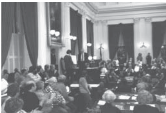
The VSO's 23rd Annual Farmers' Night