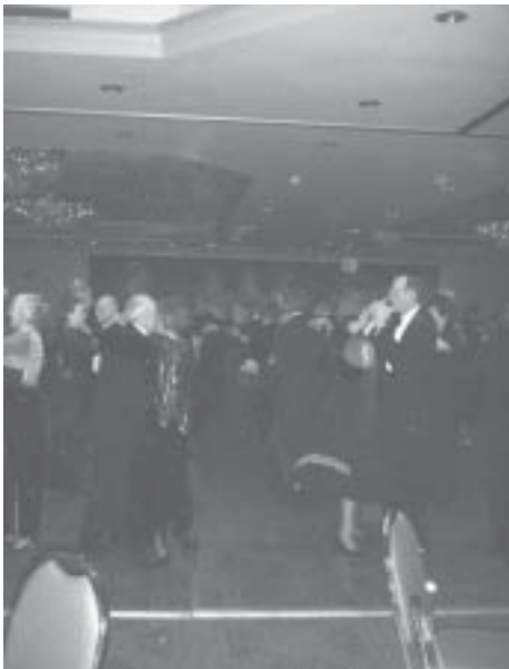
Dancing begins at the 2002 Waltz Night

The night was grand. Cream-colored roses fanned out from stately white candles while splendid waltzes, spirited tangos, and spicy swing filled the air. The Orchestra tux-