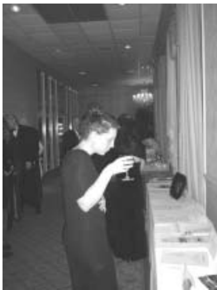
A bidder takes a quick glance at the Silent Auction during dessert.

The Silent Auction was a smashing success with almost 130 items on display. Bidders were giddy over canvases, sculptures, and other works of fine art; strikingly lovely and just plain zany housewares; jewelry to fit every throat and ear; certificates to the area's best restaurants and New England's performing arts venues; no fewer